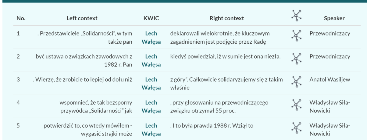
Figure 2: A KWIC index offered by Korpusomat.

The statistics of speeches within specific committees and sub-committees (see Table 2) illustrates the importance of the topics discussed.