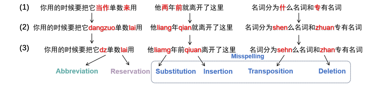
Figure 1: The illustration of pinyin conversion process. In line (1), the characters marked in red represent the Chinese characters selected to convert into pinyin; In line (2), they are converted into the corresponding perfect pinyin; In line (3), they are conducted with pinyin conversions. The pinyin conversion encompasses Abbreviations , Reservations , and Misspellings . The Misspellings include Substitution , Insertion , Transposition , and Deletion .

correction. Huang et al. (2018) combine attention-based neural machine translation model and information retrieval. Zhang et al. (2019) propose a neural P2C conversion model with open vocabulary learning. Tan et al. (2022) explore adapting pretrained Chinese GPT to the pinyin input method. In this work, different from these works that focus on how to convert pinyin sequences to Chinese word sequences better, we explore a more realistic scenario in that the input text contains both Chinese misspellings and pinyin conversions.