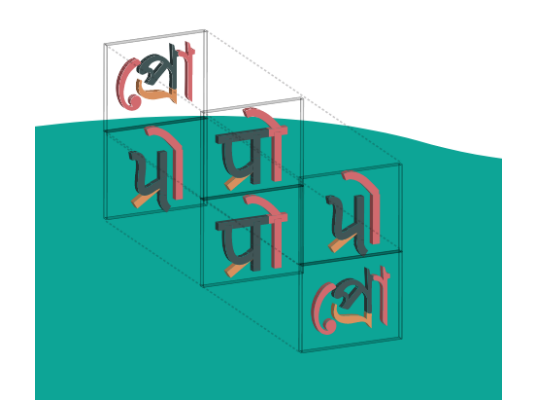
Figure 1: Orthographic components in different languages. Equivalent grapheme constituents are color-coded according to phonemic correspondence. Alpha-syllabary grapheme segments and corresponding characters from the different languages are segregated with the markers. While characters in English are arranged horizontally according to phonemic sequence, the order is not maintained in the Abugida languages.

<sup>*</sup>These authors share first authorship and contributed equally to this work