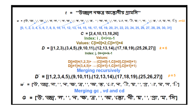
Figure 3: The workflow of our proposed grapheme parser algorithm. Here t is a given sentence.