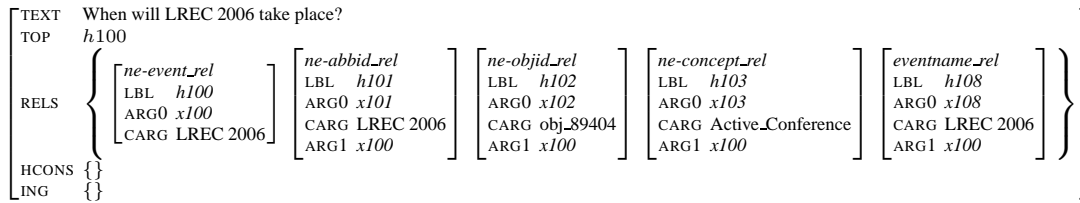
Figure 4: RMRS generated by SProUT with fine-grained named entity information.