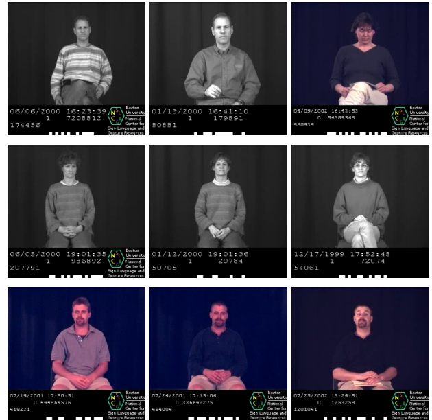
Figure 3: Example of the four speakers: due to the different clothing (short sleeves, long sleeves, glasses, etc.) and camera setups, nine speaker setups have to be handled in the RWTH-BOSTON-400 database.

For signs that are normally produced as one-handed but that may also have two-handed realizations (or vice versa: canonically two-handed signs that may sometimes be produced with only 1 hand), the one-handed and two-handed