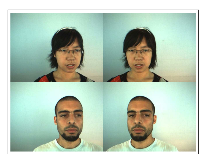
Figure 4: Samples of two speakers of the WAPUSK20 database

A database for audiovisual speech recognition has been presented. It consists of a total of 2000 sentences containing six words each available as stereoscopic video files recorded by 20 speakers. Figure 4 shows samples of two speakers out of the database. The effects of incorporat-