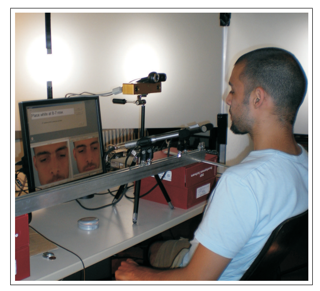
Figure 3: One speaker during recording

A lot of noise sources have been present during the recordings, such as ventilation, elevators and sounds coming from outside the building (street noise). In order to cope with low frequency noise coming from this room environment, a high pass filter has been applied to the audio channels.