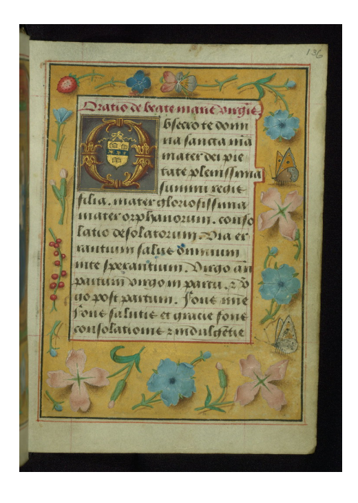
Figure 3: Example of a book of hours folio of Obsecro Te prayer that begins with ornaments.

Obsector Te<sup>14</sup> (I beseech You...) and O Intemerata (O chaste...) are two prayers that may appear early in the book of hours (e.g. right after the Gospel readings) or within the prayers section at the end of the book. The prayers are named after their first words ( incipit ): Obsector Te domina sancta Maria... , and O Intemerata, et in aeternum... , etc. Often, the beginnings of these prayers are illustrated with ornaments around the first letter of the prayer as illustrated in Figure 3<sup>15</sup>. This may lead to errors in transcriptions.