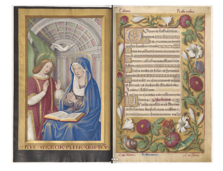
Figure 2: Two pages from the so-called "Grandes Heures d'Anne de Bretagne", a book of hours in Latin, Paris, Bibliothèque nationale de France, Latin 9474.

We provide a set of 300 transcribed books. Each book is about 300 pages long on average. Transcriptions have been generated from images made available by the BVMM Bibliothèque Virtuelle des Manuscrits Médiévaux<sup>2</sup>, the French national library Gallica<sup>3</sup>, Harvard library<sup>4</sup>, and from the Walters Art Museum and three other libraries. The document recognition system used to generate these transcriptions is based on a U-shaped fully convolutional neural network (Boillet et al., 2020) for line detection and layout analysis, and on the KALDI library (Arora et al., 2019) for text recognition. With an image such as the one in Figure 2 as input, the system outputs a line by line recognized text. The presence of decorative elements, such as miniatures, border or inline ornaments, as well as the gothic script, makes the task more difficult.