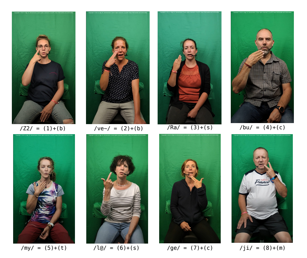
Figure 1: French CS keys represented with screenshots of CLeLfPC