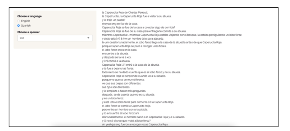
Figure 5: The 'search full transcriptions' page