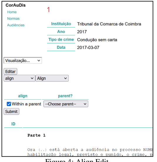
Figure 4: Align Edit.

The Align option was developed to align utterances when there is an overlap of speech. This option will only be displayed if the corpus texts have tags named align (figure 4), with at least two attributes, one named ref and another loc . Ref should have a unique id for each group of tags that should be aligned together. The loc value should be a numerical value indicating in which position the tags should be aligned. This position is the index value for the character on which the alignment should occur, as illustrated on figure 5. The align visualization will display each text within the tag in a new line, aligning them accordingly.