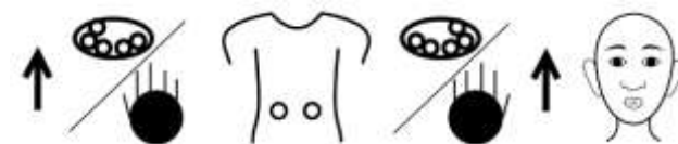
Figure 1: Written representation of the LSSiv sign for 'fire' (DND^Vc*%A^+; Lzv>< o; M^sm; NMM*)

Full orthographic representations of signs (created with Signotate; see Section 3) combine pictographic symbols which are arranged as a 'signer' facing the reader. A location symbol is placed in the center with the hands (a combined shape and orientation symbol) on either side and movement to the outside of each hand. Non-manuals are given with the location if applicable (e.g. a central torso image may have markers for hands making contact with that location and for movement of the torso itself), and additional non-manuals occurring on other parts of the body are represented on the far right. Figure 1 shows the orthographic representation of the Sivia Sign Language (LSSiv) sign for 'fire' described in the previous section: 1) the center drawing of a torso indicates zero space and circles show that the hands are near a low and central part of the torso; 2) the hand symbols on either side show a change from palm up with fingers in a rounded position to palm bodyward with fingers extended, 3) movement arrows depict a short upward path, and 4) the face on the right edge shows pursed lips. (See B. Clark 2018 for a full description of the current system and examples with corresponding videos.)