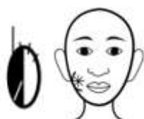
Figure 2: Written representation of the LSSiv sign for 'coca' (D><^1+; Lchk*; NMchk<>d)

locative and non-manual aspects in a single region (here, the head).